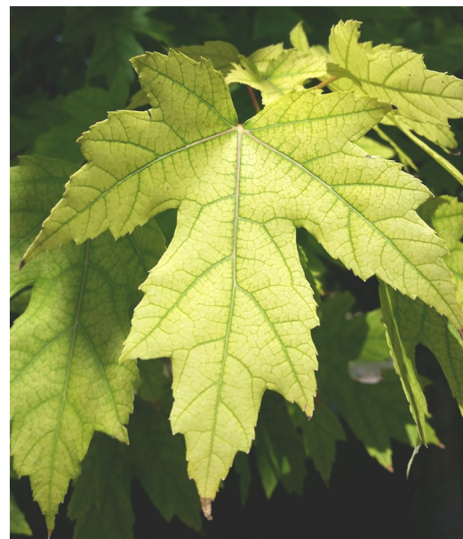
Iron chlorosis symptoms